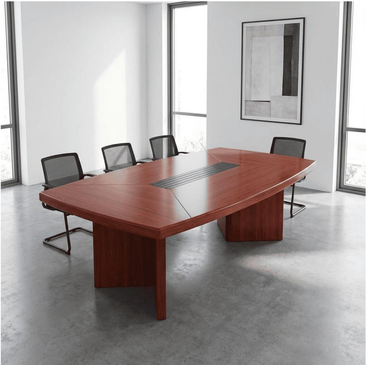
Fig 9. Boardroom table or equivalent