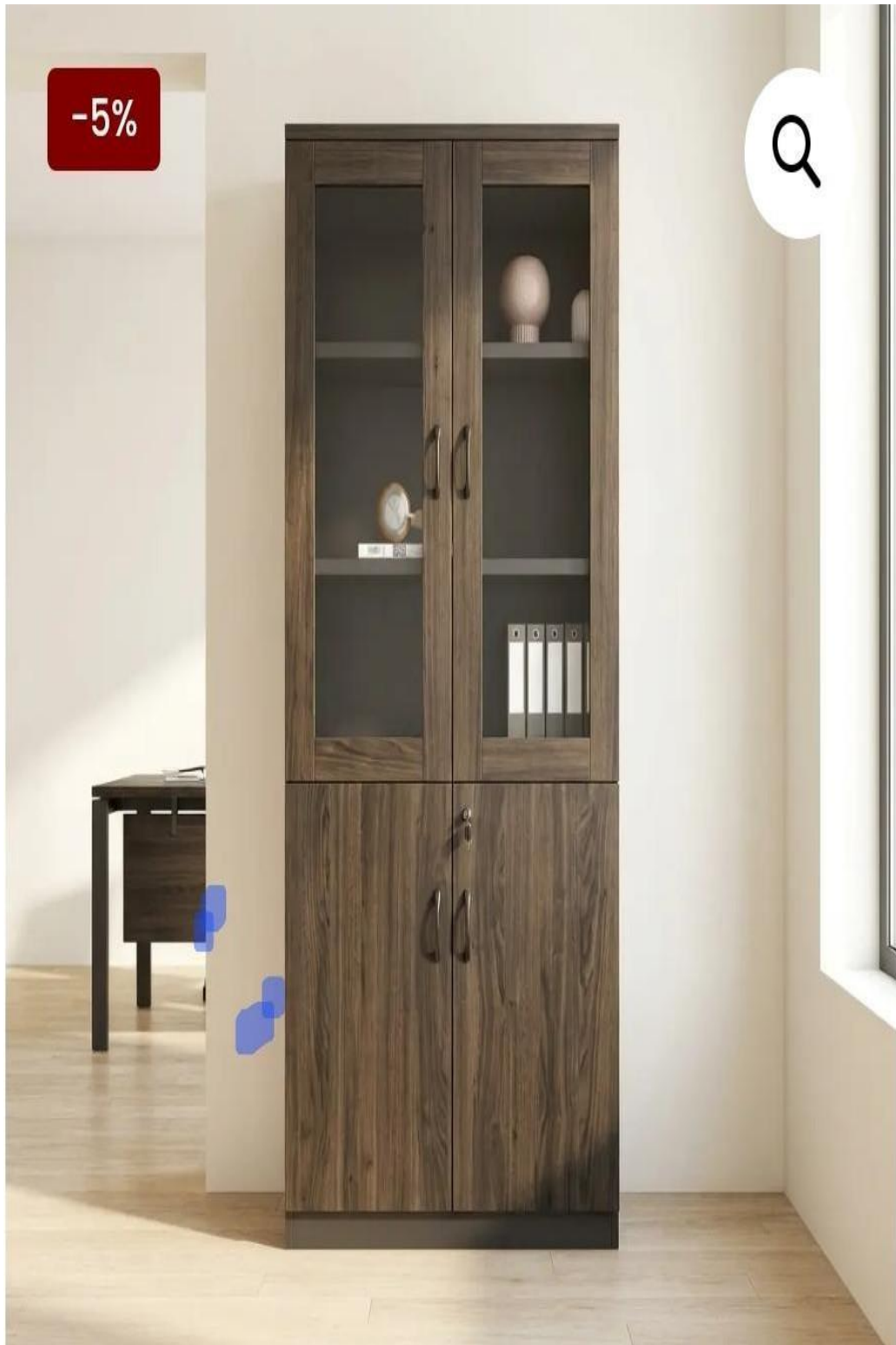
Fig 2. Pigeon hole with cupboard or equivalent