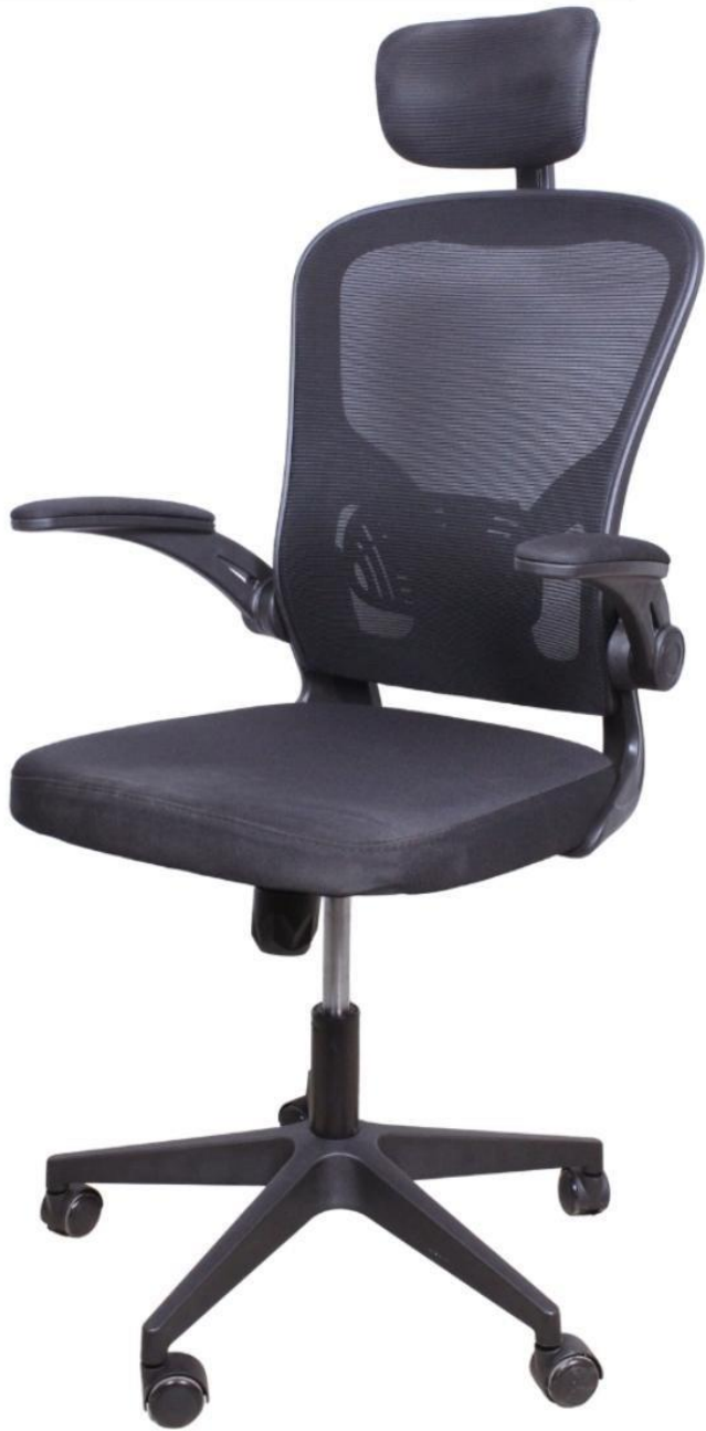
Fig 5. Executive office fabric arm chairs or equivalent