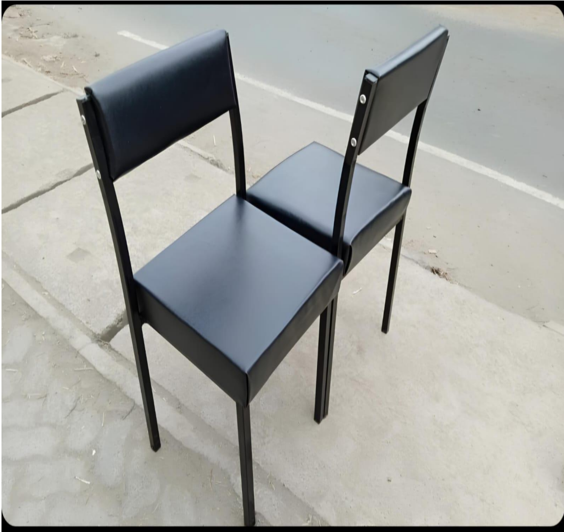
Fig 3. Staffroom Chairs or equivalent