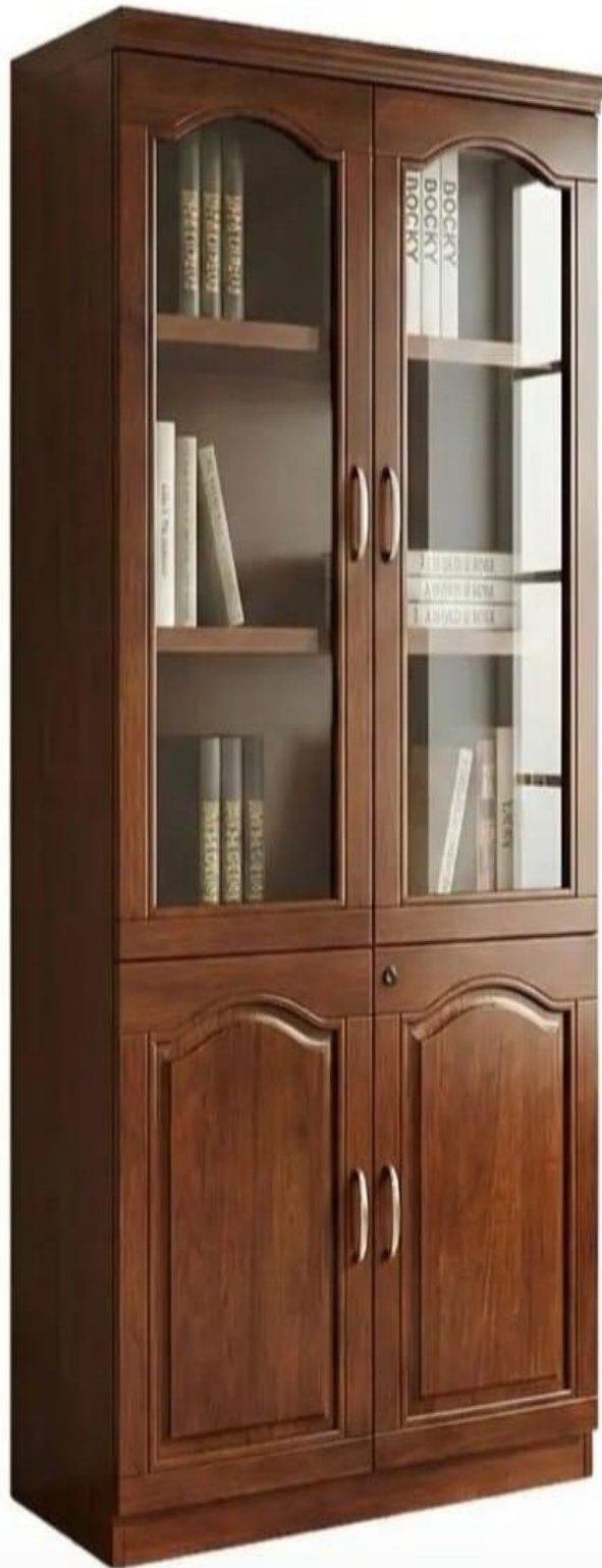
Fig 1. Wooden cabinet or equivalent