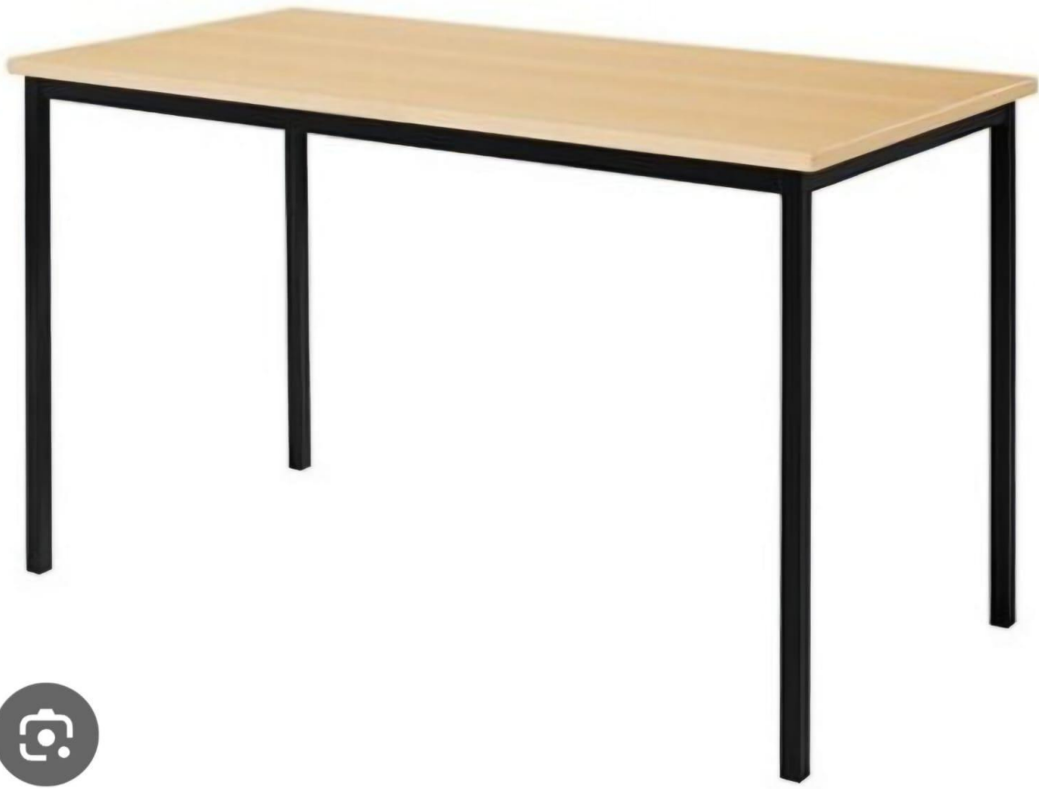
Fig 4. Staffroom Tables or equivalent